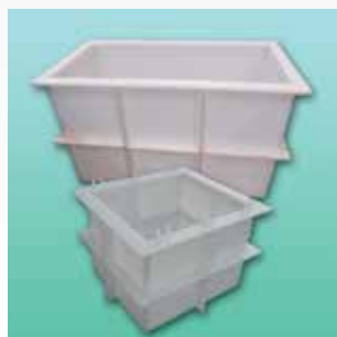
PP-PE, PVC Tanks