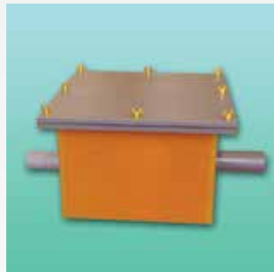
Pressure Breaking Chambers