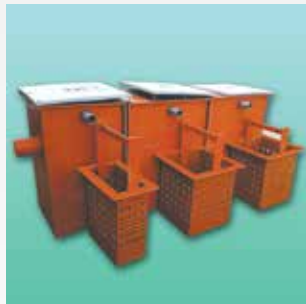
Grease Trap Type C