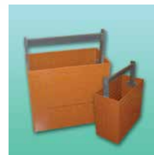
Sand Trap Basket