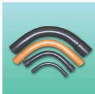
Long Radius Bends