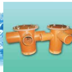
Dry Gully Traps