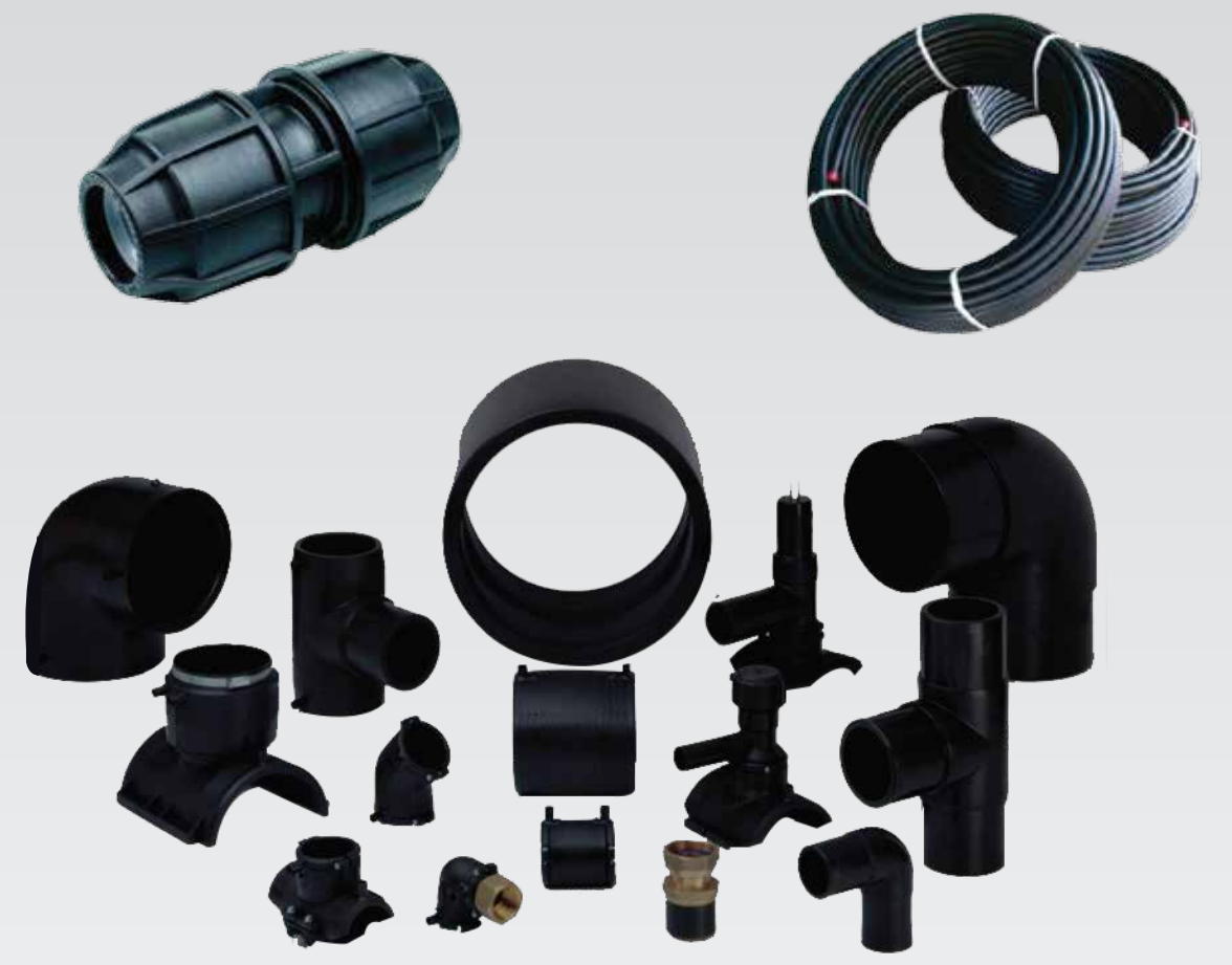
HDPE Pipe & fittings for water, gas & Irrigation system complete range in SDR 11 & SDR 17 (Electro fusion & Butt Fusion)

It unites all the requirements of a modern house discharge system from sound insulation and fire protection. Its Chemical resistance and hot water resistance have been taken on. What has come about is a qualitatively high grade house discharge pipe system with a maximum degree of compliance to all the requirements.