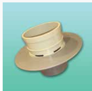
Perforated Flange Socket