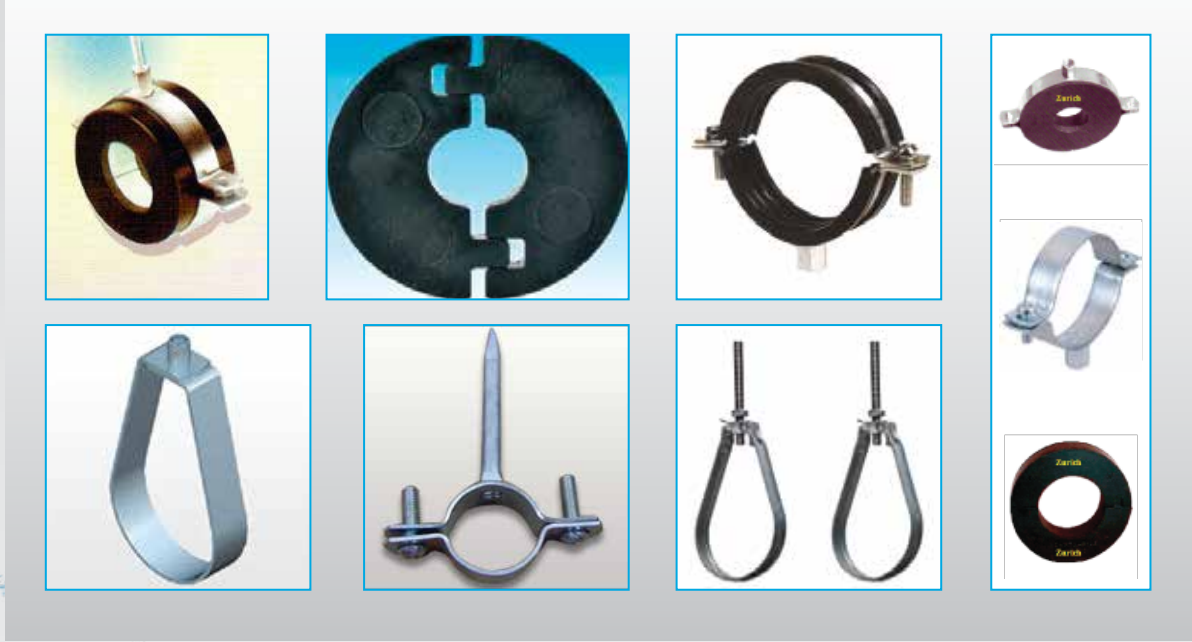
GI hanging clamps with dual nuts M8 / M10 Noise suppression rubber strip according to DIN 4109