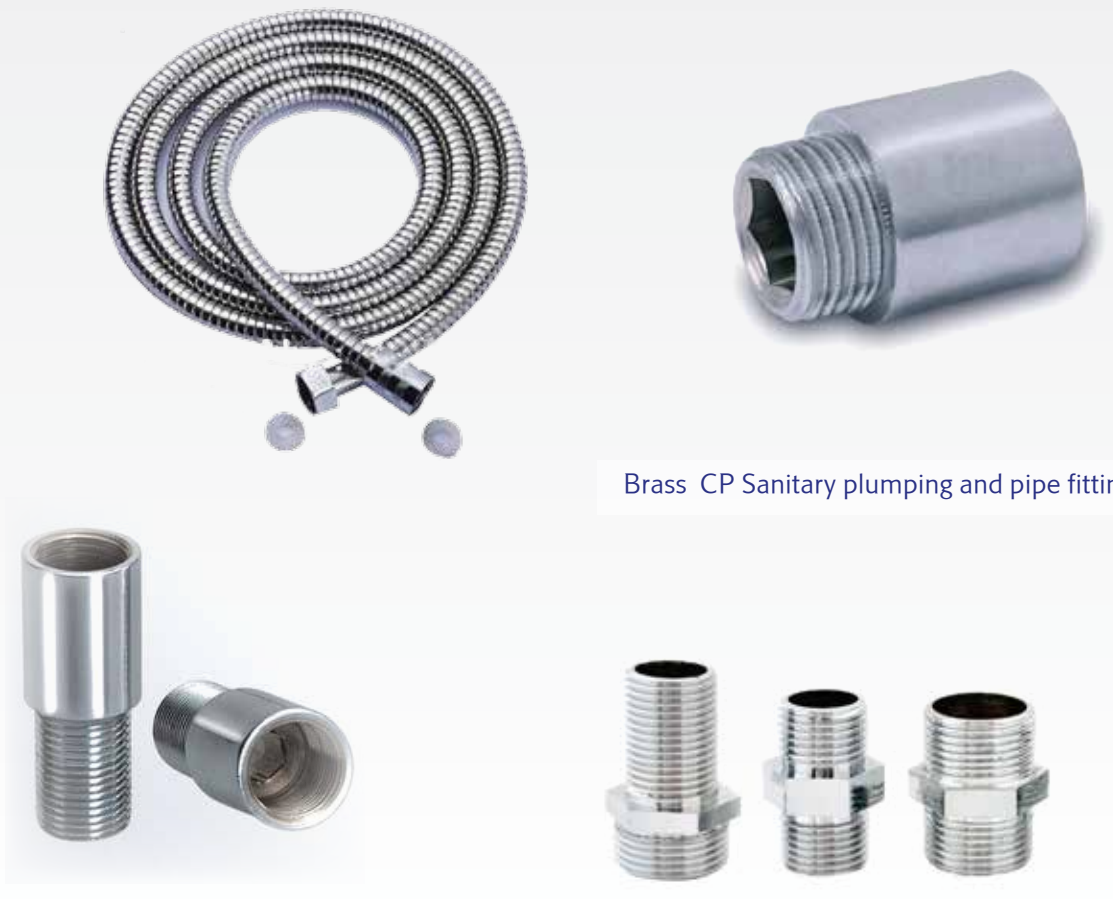
Brass CP Sanitary plumbing and pipe fittings